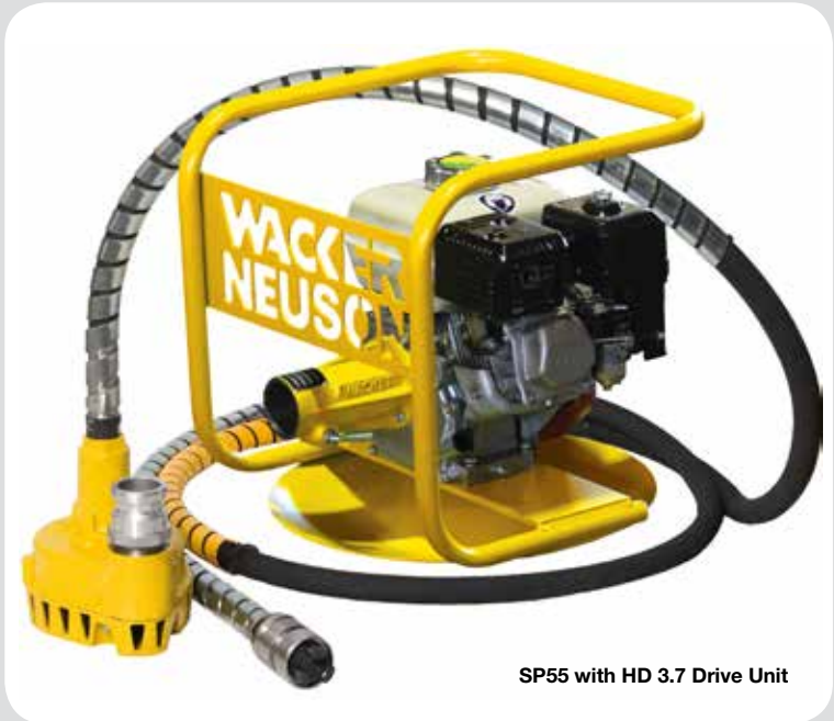
SP55 with HD 3.7 Drive Unit